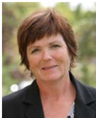
Crystal Craig Ancient Echoes Interpretive Centre, Herschel