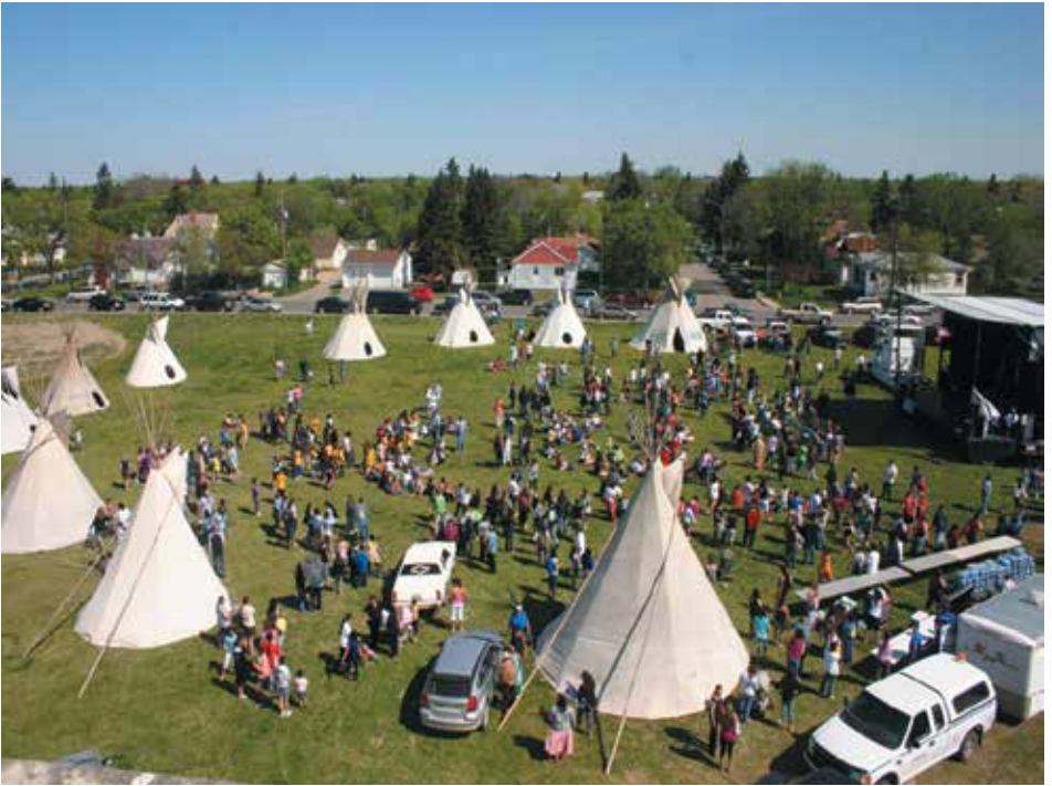
2009 Smudge Walk gathering in Scott Collegiate sports field to heal the North Central Regina neighbourhood.