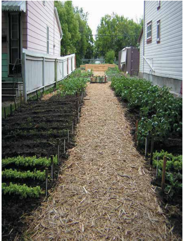
A Community Garden in a vacant North Central Regina lot. The Gardens received a City of Regina Crime Prevention Award.

Ecomuseum activities are aimed at culture in a broader sense – as the evolving set of artifacts, behaviours, values, and assumptions that affect the way people live – but they can be an effective way to facilitate the development of a cultural plan, or to bring an existing one to life. The vision, mission, and partnerships that make up an ecomuseum can provide valuable context and visibility as a culture plan is implemented.