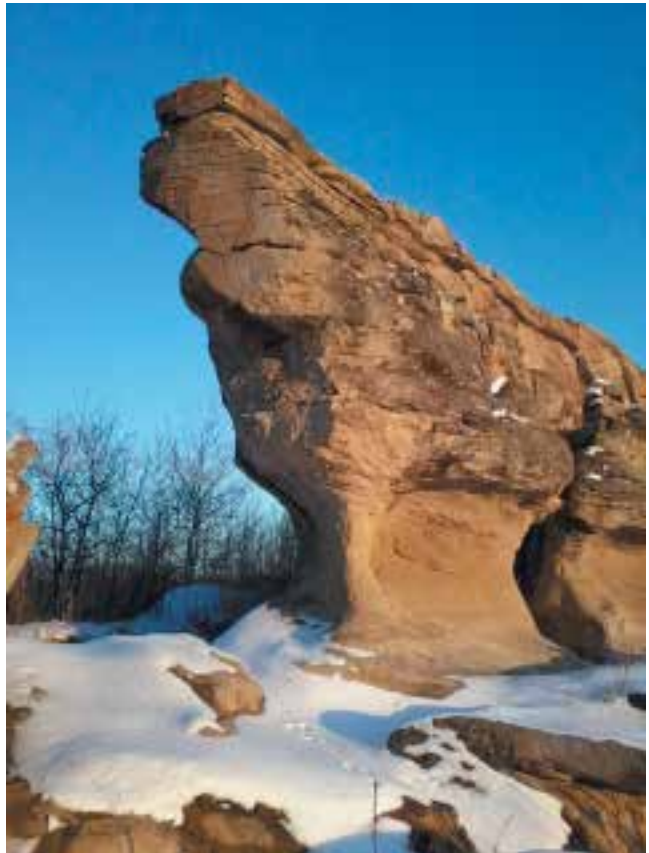
Roche Percee Provincial Historic Park

In conclusion, the development of ecomuseums in Saskatchewan is based on community engagement; consultation and collaborative decision-making that generates participation and support from a broad range of community residents. Community development in this context is viewed as an ongoing negotiation of values and common interests that includes both natural and cultural heritage; both tangible and intangible cultural heritage. Saskatchewan's ecomuseums are locally defined and address contemporary issues and local concerns aligning well with the broader concept of "living heritage" as a dynamic aspect of daily life. There are many ways to contribute to sustainable community development as the various models described in this paper attest. An ecomuseum however, takes a more inclusive, holistic approach and demonstrates "living heritage" in action.