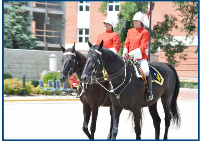
RCMP Heritage Centre employees on parade at the RCMP Depot.