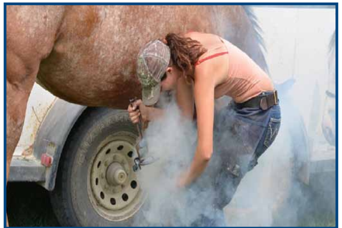
Farrier demonstration at Rocanville's Market at the Museum.