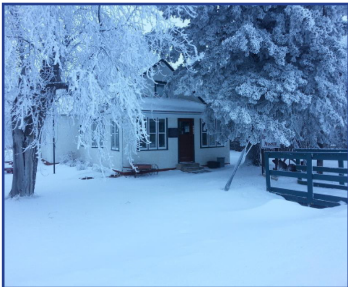
The Reynold Rapp Museum in Spalding on a recent frosty day.

The Executive Director participated in this year's annual "Museum Day on the Hill" in Ottawa Nov. 18th. She was one of approximately 40 participating museum representatives from across the country taking part in this year's event. Participants were placed in teams of three people who attended individually scheduled meetings with the approximately 40 Members of Parliament and Senators over the course of the day. The three topics discussed were funding to Young Canada Works, a review of the Federal Museum Policy and associated programs and the creation of a short-term matching donation program for museums.