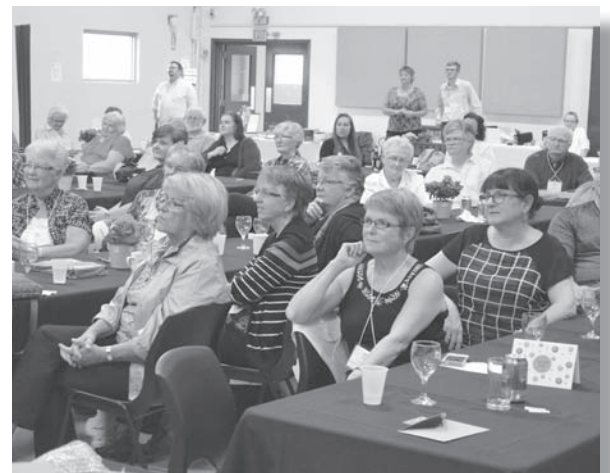
Conference attendees in Swift Current