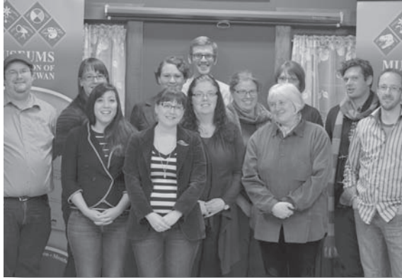
Peer Exchange participants touring the Saskatoon WDM

Our second annual Peer Exchange was held in fall 2014 at the Saskatoon Western Development Museum, and was a great success. Museum professionals presented to their colleagues from around the province about insights and challenges related to their museum work, and had the opportunity to network and benefit from each other's skills and experience. In 2015, we plan to hold Peer Exchange events in both Regina and Saskatoon, to make the program as accessible as possible for our members.