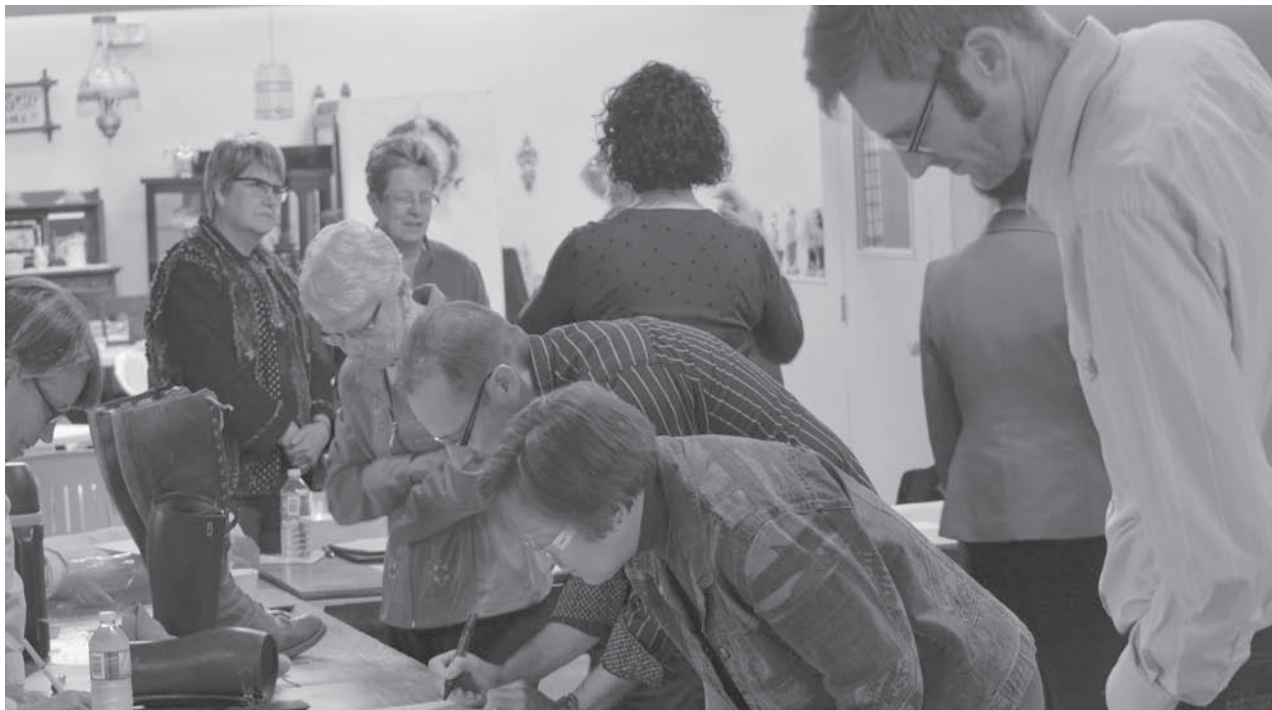
Pop-Up Museums workshop at the Assiniboia District Museum

The MAS library is a great source of information and resources for all aspects of museum work. Containing over 1730 items, it is full of best practices, case studies, and practical knowledge that can benefit a museum. Current categories in the Resource Library range from Accreditation to Technology. Many new items were purchased this year, including Dinosaurs and Dioramas: Creating Natural History Exhibitions and Collecting the Contemporary: A Handbook for Social History Museums .