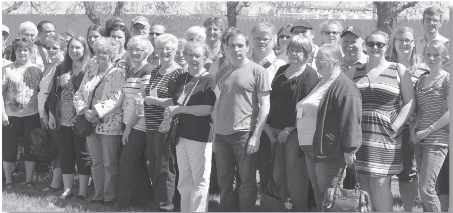
A group photo while on tour at Doc's Town Heritage Village in Swift Current