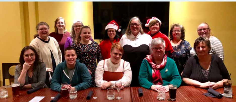
Above: The MAS Staff & Board had a Holiday Gathering in November.

The MAS Board & Staff Quarterly Report is published in July, October and January. The Annual Report is issued in May.