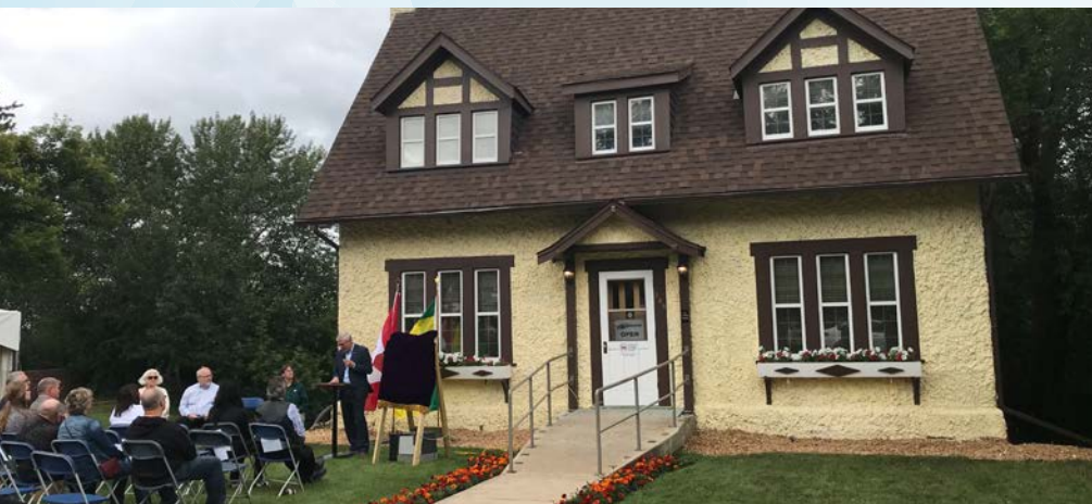
Above: Diefenbaker National Historic Site dedication, Prince Albert.

One of the questions the Board asked at this Fall's Network meetings was about the federal election. We asked you, "What's one thing you would tell the federal candidates and what is one thing you would ask them?" It was interesting to hear what was important to you.