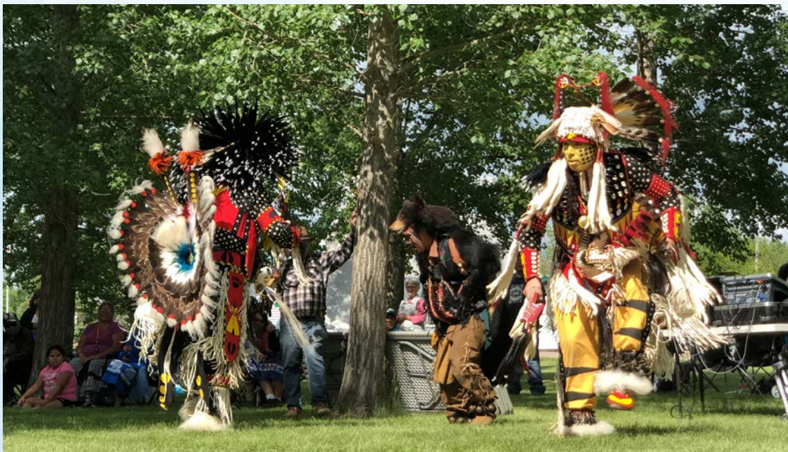
Moving Towards Reconciliation Mini Pow Wow at Clayton McLain Memorial Museum. Dancers from Little Pine & Lucky Man First Nations.

Website Visits 19,000 Sessions Jul. 1 - Oct. 1