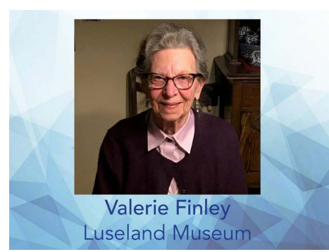
To learn more about the 2020 Award Recipients, visit our website.

We gratefully acknowledge the support of: