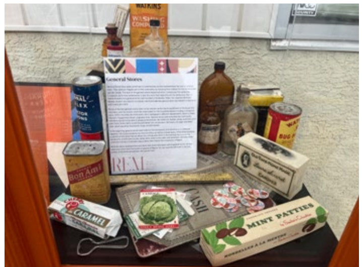
Images: The Regina Ecomuseum (RFEM) Exhibit located in Lakeview, Regina.