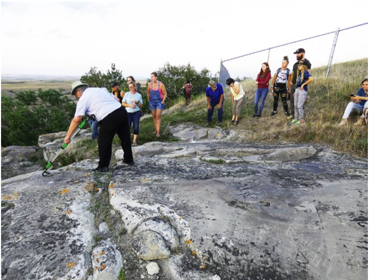
Image: St. Victor Petroglyphs Displays & Provincial Historic Park Tours Provided by The Friends of St. Victor Petroglyphs