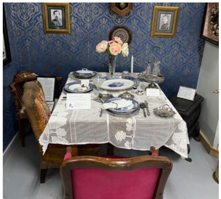
Images: Fort Qu'Appelle Heritage Museum, Exhibits.