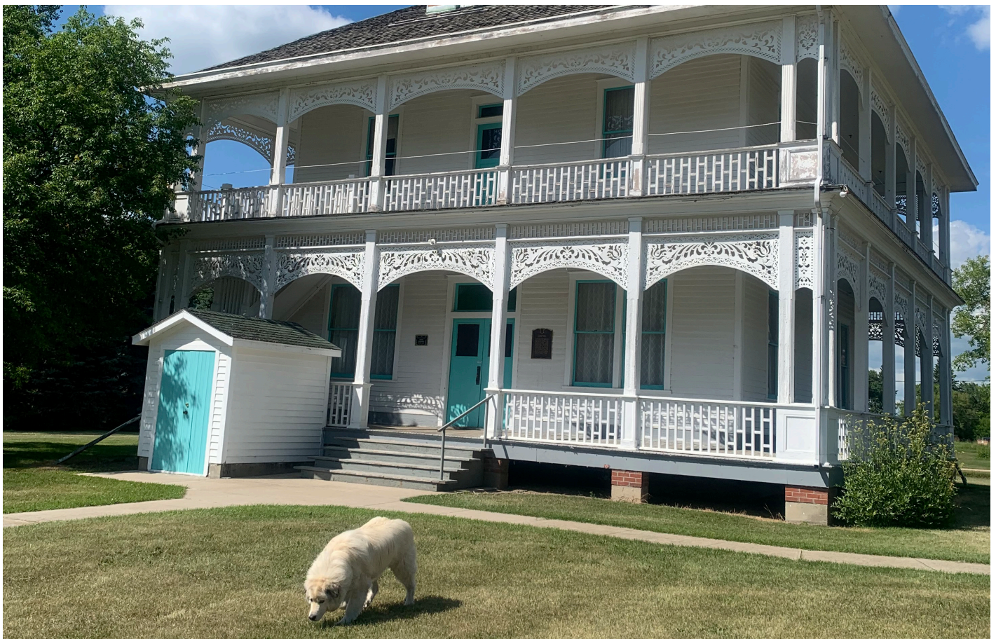
Image: Dog Days of Summer.

Kits are designed to be easily used, containing all necessary component parts and resources to assist users with completing their projects. MAS has plans to continue to develop the equipment loan program to ensure that it supports members in their preservation and promotion of Saskatchewan arts and heritage. Any questions about the Equipment Loans may be directed to the Museums Advisor at advisor@saskmuseums.org .