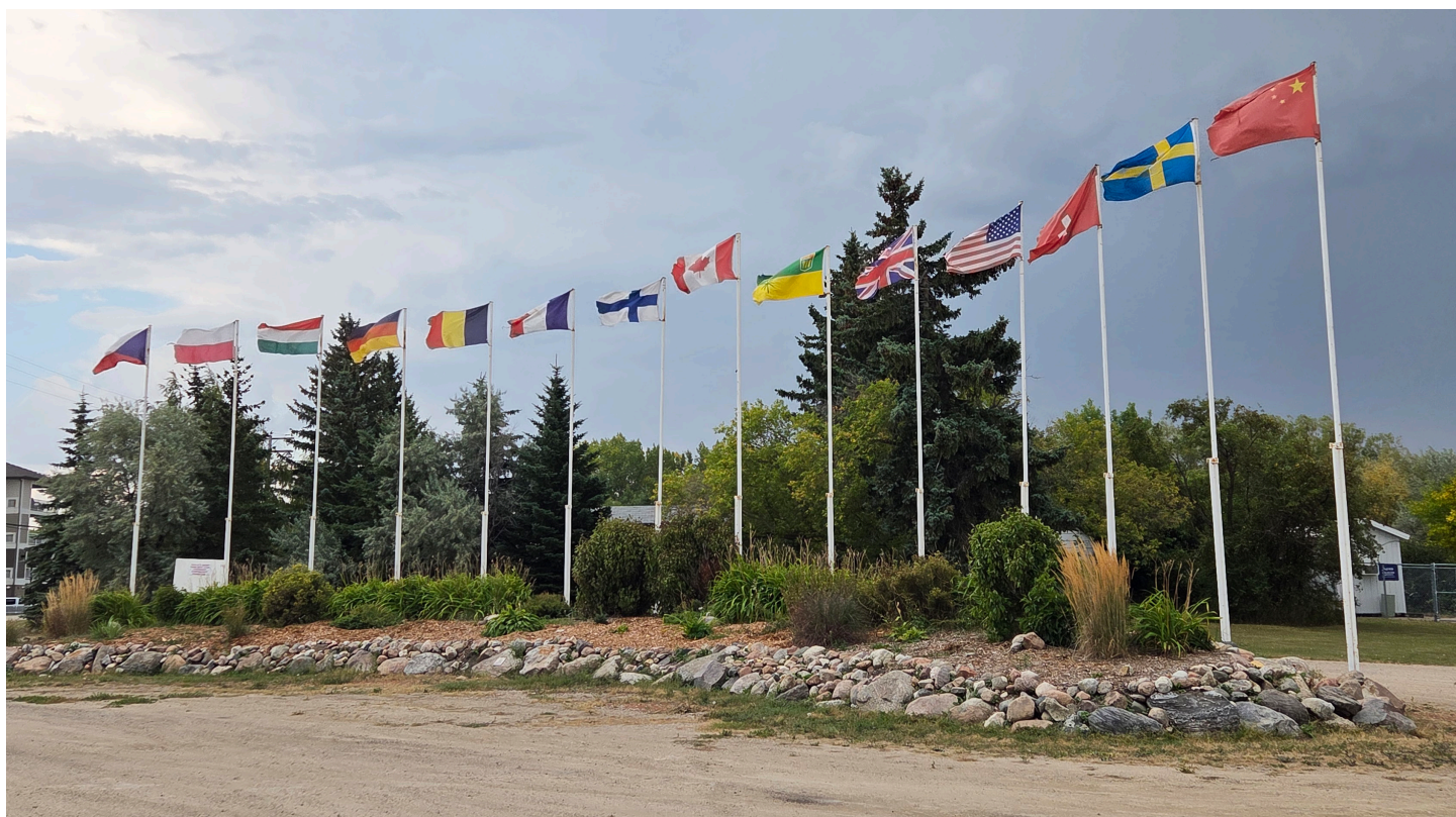
Image: Flags in Whitewood.

MAS would like to thank the Government of Saskatchewan and PCS for this ongoing financial support for museums in Saskatchewan. The impacts for our members are significant, and MAS is grateful for the Government of Saskatchewan's recognition of this need and investment in our communities through museums.